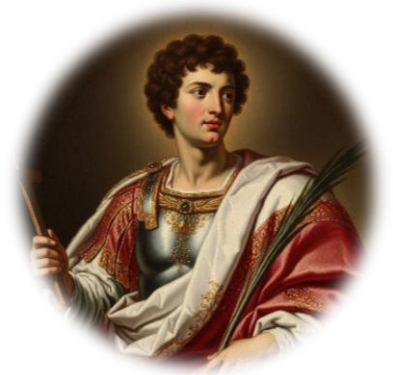
St. George, Martyr – April 23

Please give at the parish using a ShareLife envelope, online through our parish website, or at sharelife.org/donate .