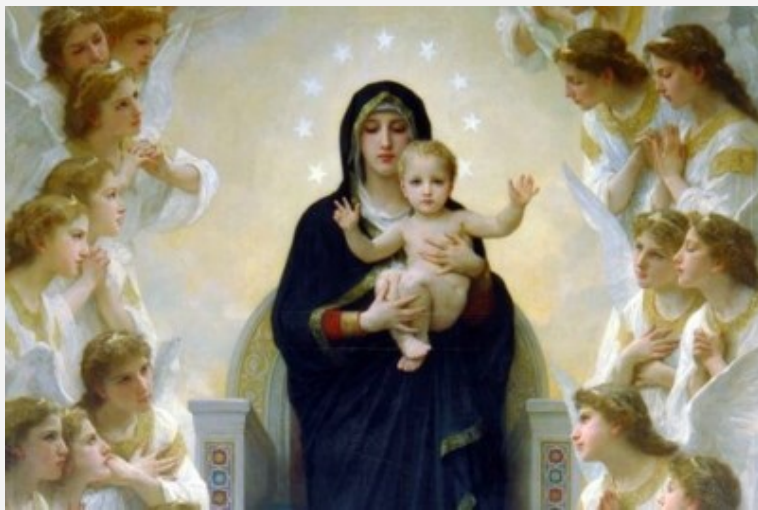
Taken from the Living with Christ booklet Vol. 29, No. 1; Pg. 34

Contemplating the future can be scary. God has a plan for each of us, but he unfolds it little by little. None of us know the full picture or implications. Let us pray to have Mary's trust, peace and confidence as we contemplate the year ahead.