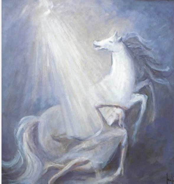
“What am I to do, Lord?”

Throughout history God has never abandoned those who love Him. In the Old Testament He sent prophets, like Ezra in today’s first reading, to encourage and give hope to His people when they were discouraged. For the people, listening to Ezra’s words was not like simply hearing someone tell a story. It was a living experience of true listening which made them cry and then rejoice. It was something that touched their hearts and transformed their lives. This is what happens to anyone who truly listens to God’s Word. St Paul is a typical example of this reality. During this week we shall be celebrating the day when he heard God’s voice on the road to Damascus. There, Paul listened. “What do you want me to do, Lord,” he asked while he was still on the ground. Through that act of listening Paul allowed God’s Word to transform his life. From then on, he became a bearer of good news to the whole world.